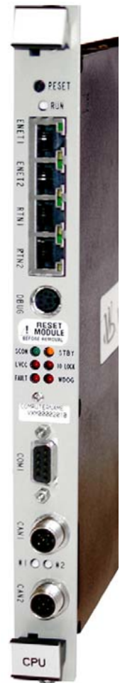
MicroNet Plus CPU5200

The MicroNet Plus system is capable of running in a redundant master / standby configuration to provide higher availability. Synchronized memory assures that both CPUs use the same operating information in every rate group. If the master CPU becomes inoperable, full system control, including control of the I/O, is transferred to the standby CPU in less than 1 ms without affecting prime mover operation. After correcting the master CPU fault, the system can continue running on the standby CPU, or control of the system can be transferred back to the original master CPU. Annunciation of any control transfer is given through communication links.