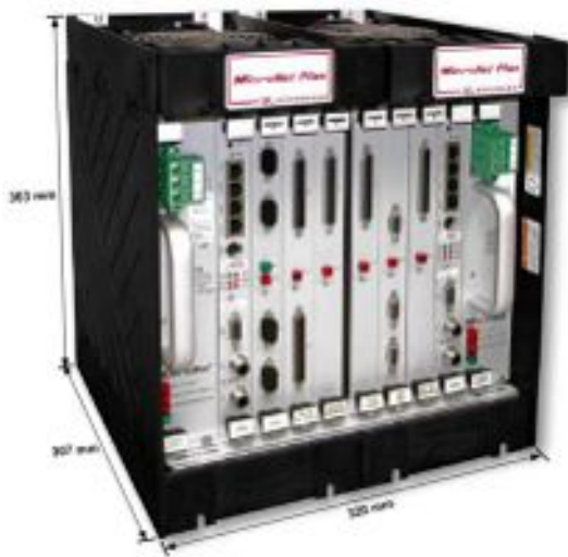
MicroNet Plus Control Chassis (8 VME slot option)

Power supplies may be simplex or redundant in any combination of input voltages.