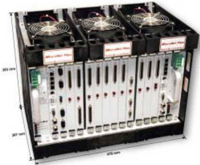
MicroNet Plus Control Chassis (14 VME slot option)